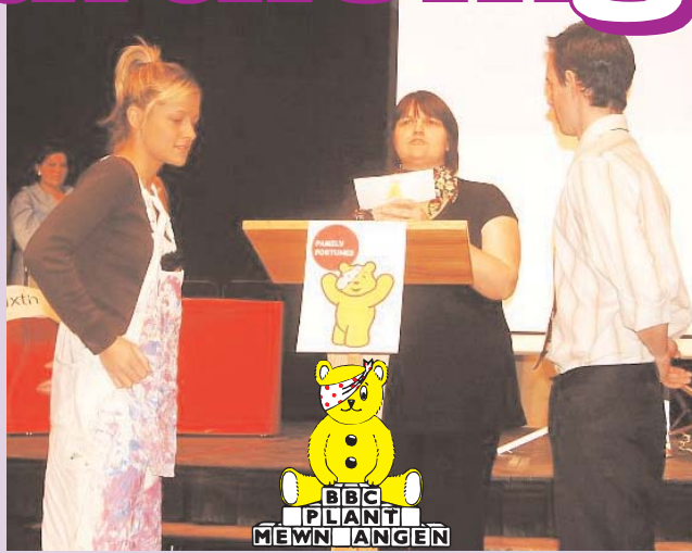
BBC Children in Need Appeal

We make no apology for printing so many pictures of what many have described as our best organised and most entertaining fundraising event ever.