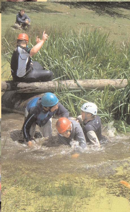
A classic 'what happened next' scenario comes to its inevitable conclusion.