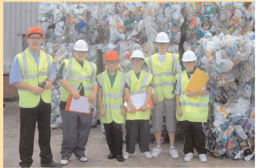
Our recycling group got to see the next stage of the process and the incredible volume of waste when they visited Bryn Pica Recycling Plant.