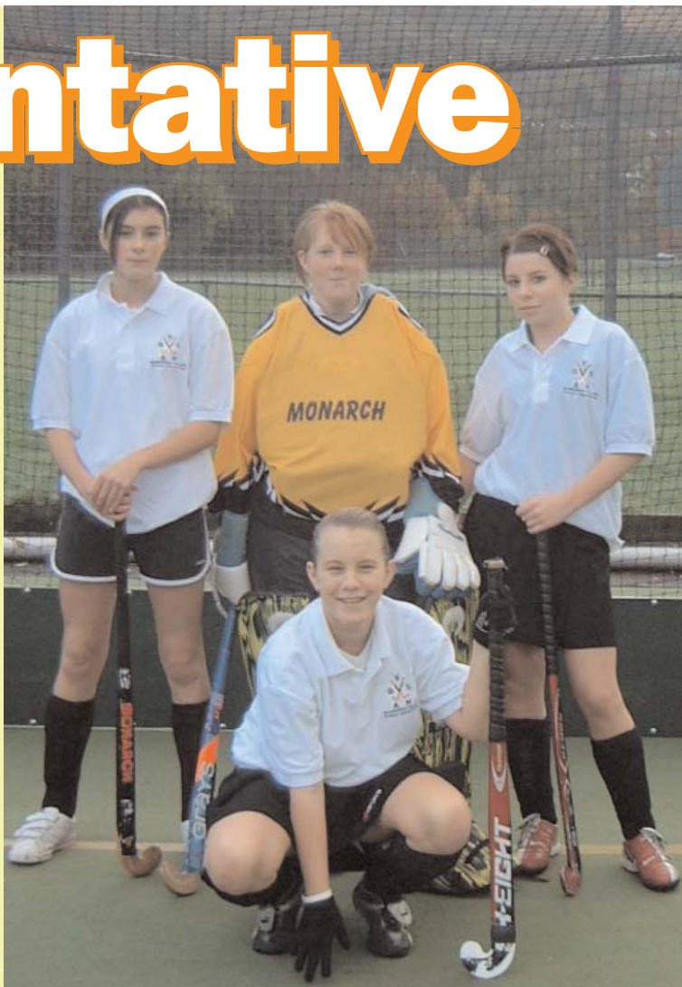
Year 9 girls are pleased to gain places in the County Hockey team.

All this success doesn't mean there is no room for more players - if you want to be part of the success story, come along and train.