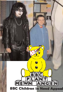
BBC PLANT MEWIN IANGEN BBC Children in Need Appeal